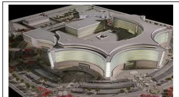
Figure 6: Jaber Al Ahmad Al Jaber AL Saba Hospital

The first phase of the Jaber Hospital was inaugurated in by His Highness the Emir Sheikh Sabah Al-Ahmad Al-Jaber Al-Sabah in November 2018 after many challenges. The main building of the hospital comprises of five structures each of which is 10 stories high. With over 1100 hospital beds, a helipad, 36 operating rooms, and parking for over 5000 vehicles, the hospital occupies 725,000 sq. meters. The hospital is aimed to be one of the major hospitals in the Gulf region – providing significant medical services to Kuwait and the region.