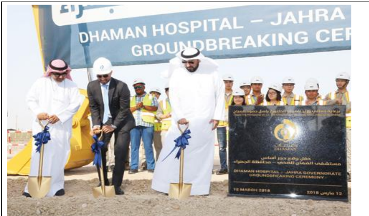
Figure 3: Health Minister Sheikh Dr. Basel Al-Sabah (right) takes part in a groundbreaking ceremony of the Dhaman Hospital

This comes in addition to signing an agreement with JCI, an international non-profit organization and the oldest and largest accreditation organization in the field of healthcare in the world, to strengthen and enable core activities to meet standards in clinical care, effective leadership, safe facility management and continuous quality improvement.