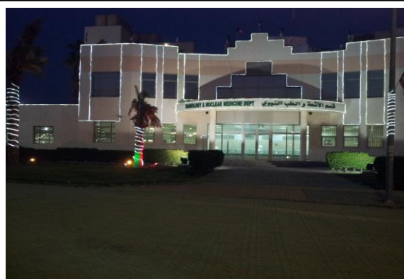
Figure 1: Al-Jahra Hospital Nuclear Medicine and Radiology Building

While the MoH maintains a solid end state vision of the healthcare system (separation of regulator, from provider and payor functions, with a strong dedication to improving quality and private sector participation as was done in the neighboring emirate of Abu Dhabi), the establishment of KHAC and the Private Health Insurance Initiative for Kuwaiti Retirees are seen as strong contributors to the diversification of health system finance in Kuwait. The 2011-12 Kuwait Government budget was the first time the Ministry of Health spends over 1 bn KD (3.3 bn USD) on the expenditure on the public healthcare system. The budget for 2018-19 is close to 17 bn KD , and the budget of the Ministry of Health is over 2 bn KD.